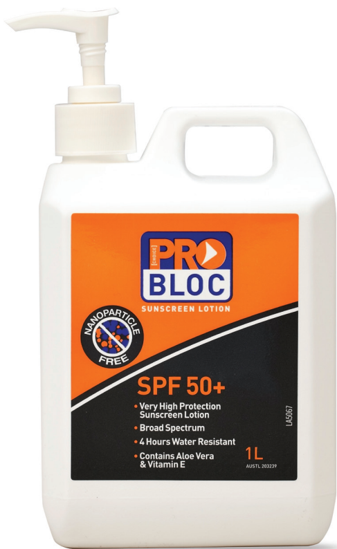
SS1-50 - PROBLOC 1L Bottle